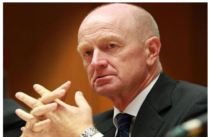
Glenn Stevens: Something he did NOT say became accepted as fact by media.

Media coverage focused exclusively on the reference to the possibility of a "hard landing" and portrayed this as being the core message of the OECD report.