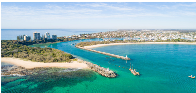
SEA CHANGE TOWN?